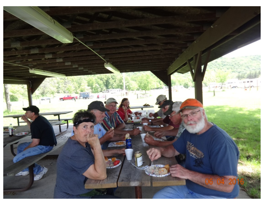
Lunch supplied by Zumbro Bottoms Equestrians More photos on page 14