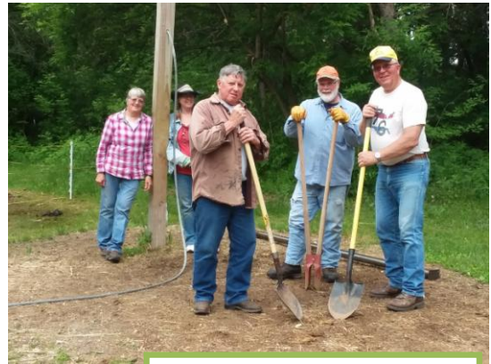
Replacing and repairing tie lines